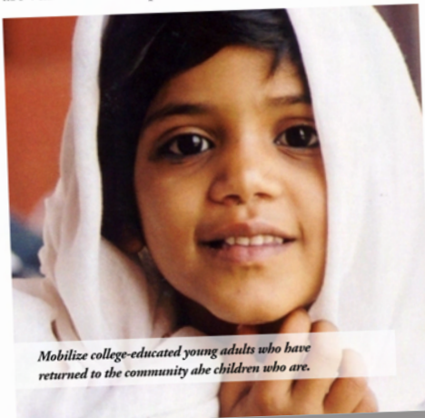
Mobilize college-educated young adults who have returned to the community as children who are.

Lack of education impacts every area of life in Mudaba communities. Illiterate farmers are vulnerable to exploitation, and rarely receive a fair value for the produce they sell at